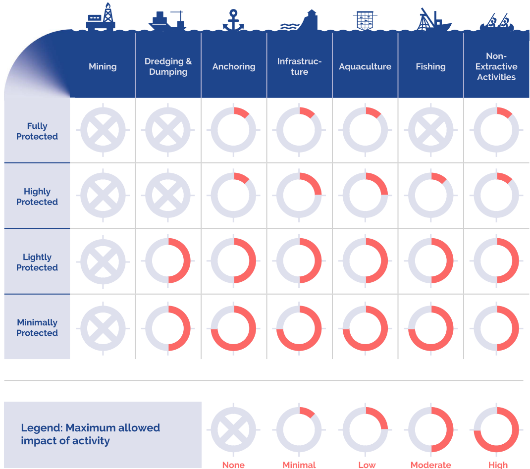
Fig. 1. Level of protection based on maximum allowed impact of seven potential activities in MPAs. An MPA or MPA zone can be categorized into one of four LEVELS of protection: Fully, Highly, Lightly, or Minimally, on the basis of seven types of activities and their impacts (a decision tree approach is available in fig. S2). Dials indicate the scale of impact that may be occurring at a given protection level: none, minimal, low, moderate, or high/large. If impacts are high/large, the

duration, and frequency relative to biodiversity conservation goals and is described as “none,” “low,” “moderate,” “high/large,” or “incompatible with biodiversity conservation” (Fig. 1 and fig. S2). Using this impact scale, a LEVEL of protection can be assigned for any given MPA or zone regardless of location, species, or circumstances. Impacts of certain activities may scale differently considering specific features of an MPA or zone, such as size; for example, distribution of an activity across areas of different sizes may render it high impact in a smaller MPA but moderate impact in a larger MPA. Incompatible activities include industrial extraction such as industrial fishing (for example, vessels > 12 m using towed or dragged gears), oil and gas exploration, mining, or other extremely impactful activities such as fishing with dynamite or poison (supplementary materials, LEVELS Expanded Guidance,